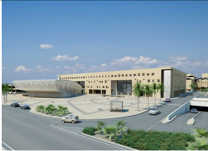
King Khalid University Hospital

Photographs of the branch office and city where the branch is situated